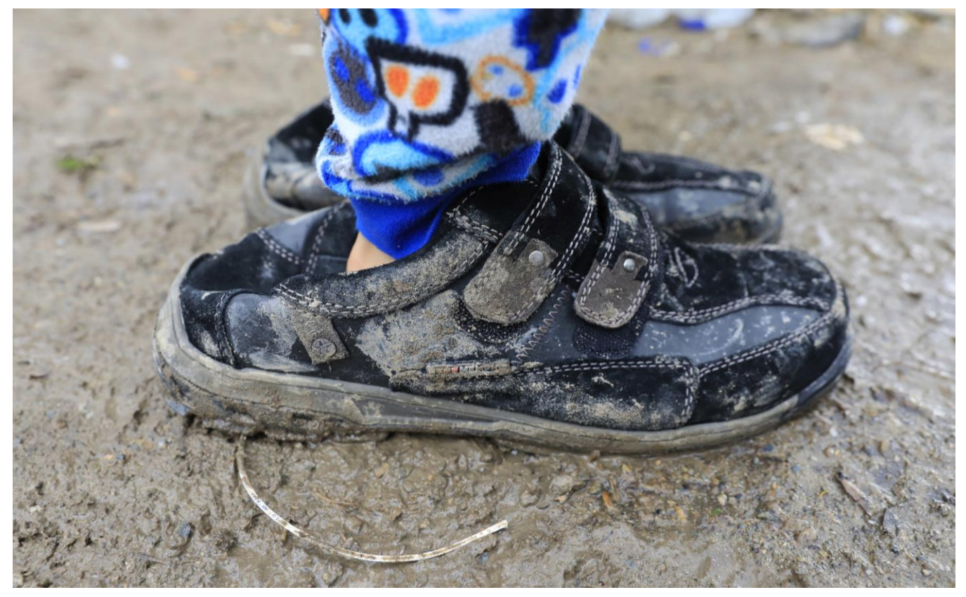
A child stands outside of his family tent in the rain in an area just outside Moria Camp known as the olive grove or 'jungle'.