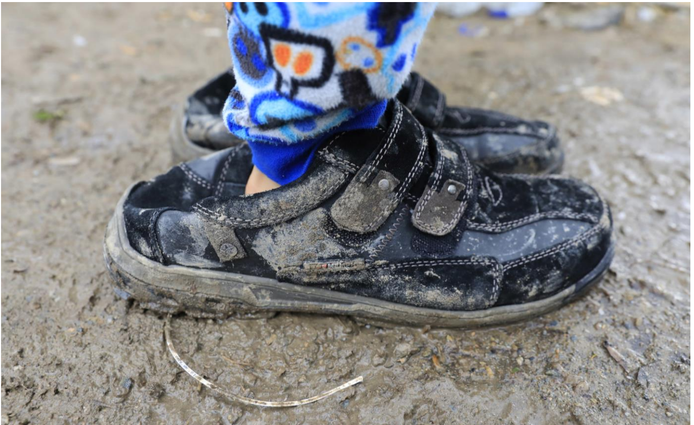
A child stands outside of his family tent in the rain in an area just outside Moria Camp known as the olive grove or 'jungle'.